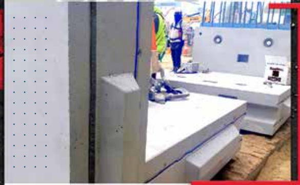
PRECAST & CAST-IN-PLACE COMBO BUILDING ACCESS TUNNEL