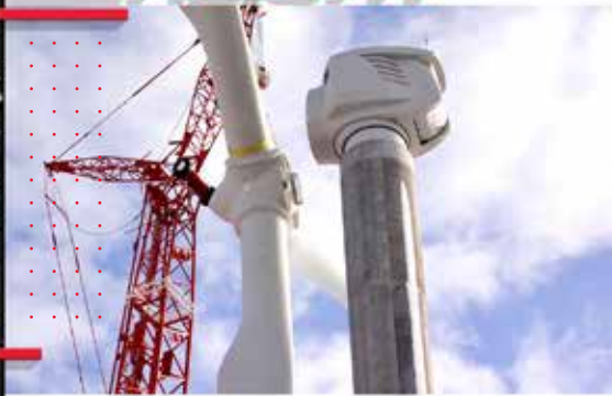
100 METER TALL PRECAST WIND TURBINE TOWER