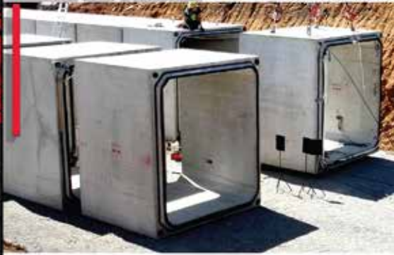
1 MILLION GALLON WATERTIGHT STORMWATER DETENTION SYSTEM